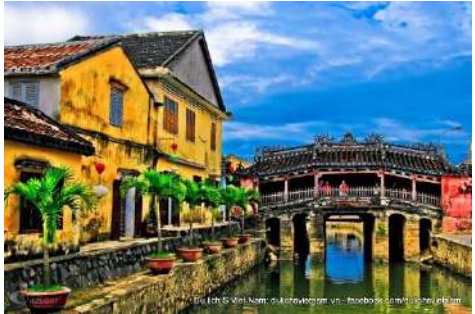
Japanese Covered Bridge