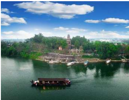
Thien Mu Pagoda