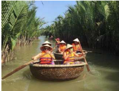
Pagoda Basket boat