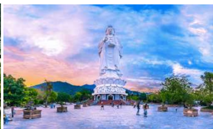
Linh Ung pagoda