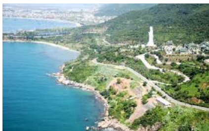
Son Tra Peninsula