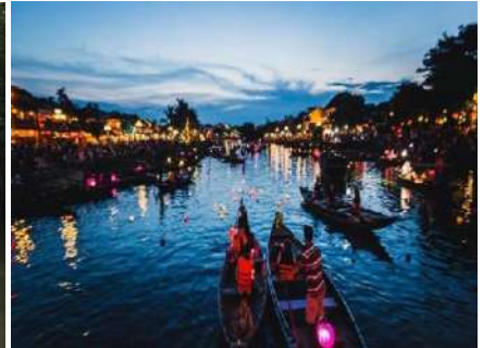
Hoi An at night